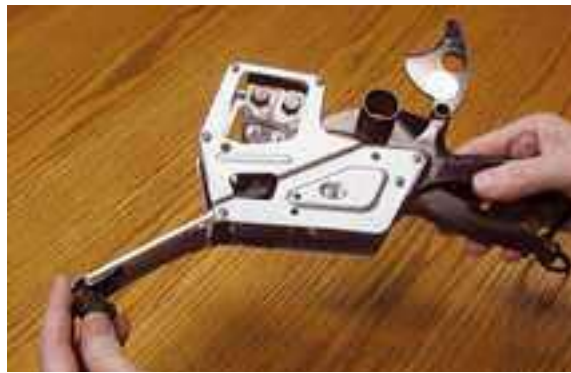
Ready to load