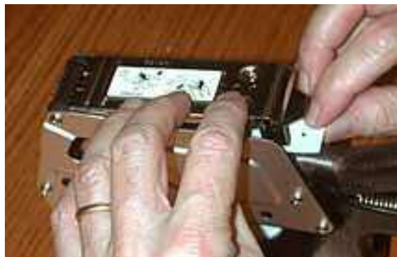
Close the bottom cover. (Label waste is dispensed between the handles.) Your price-marker is now loaded and ready for action!