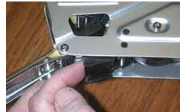
Pull down on the forward part of the printbase. This will open the path for the labels to pass through