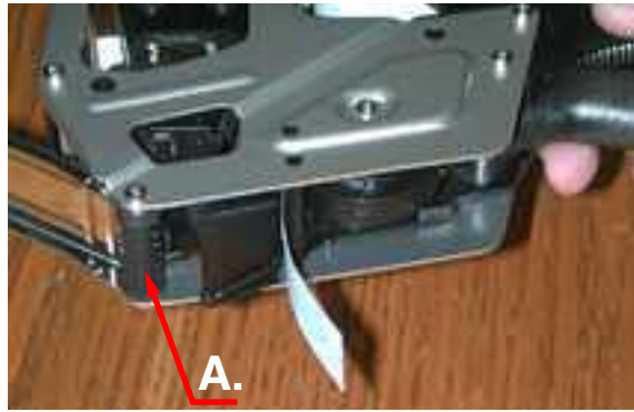
Note: When threading the labels do not pass them through the roller A.