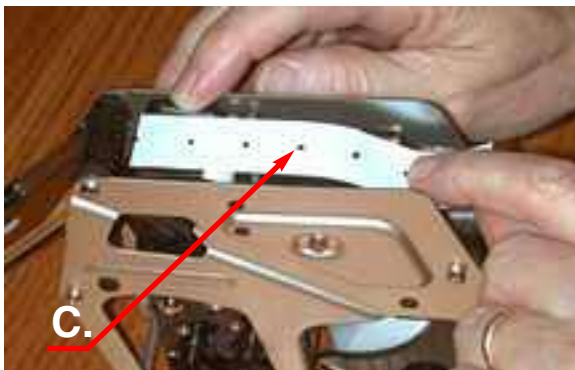
Fold labels back over and align holes in the labels with pins on the sprocket C.