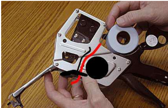
Pass labels through the label path as shown.